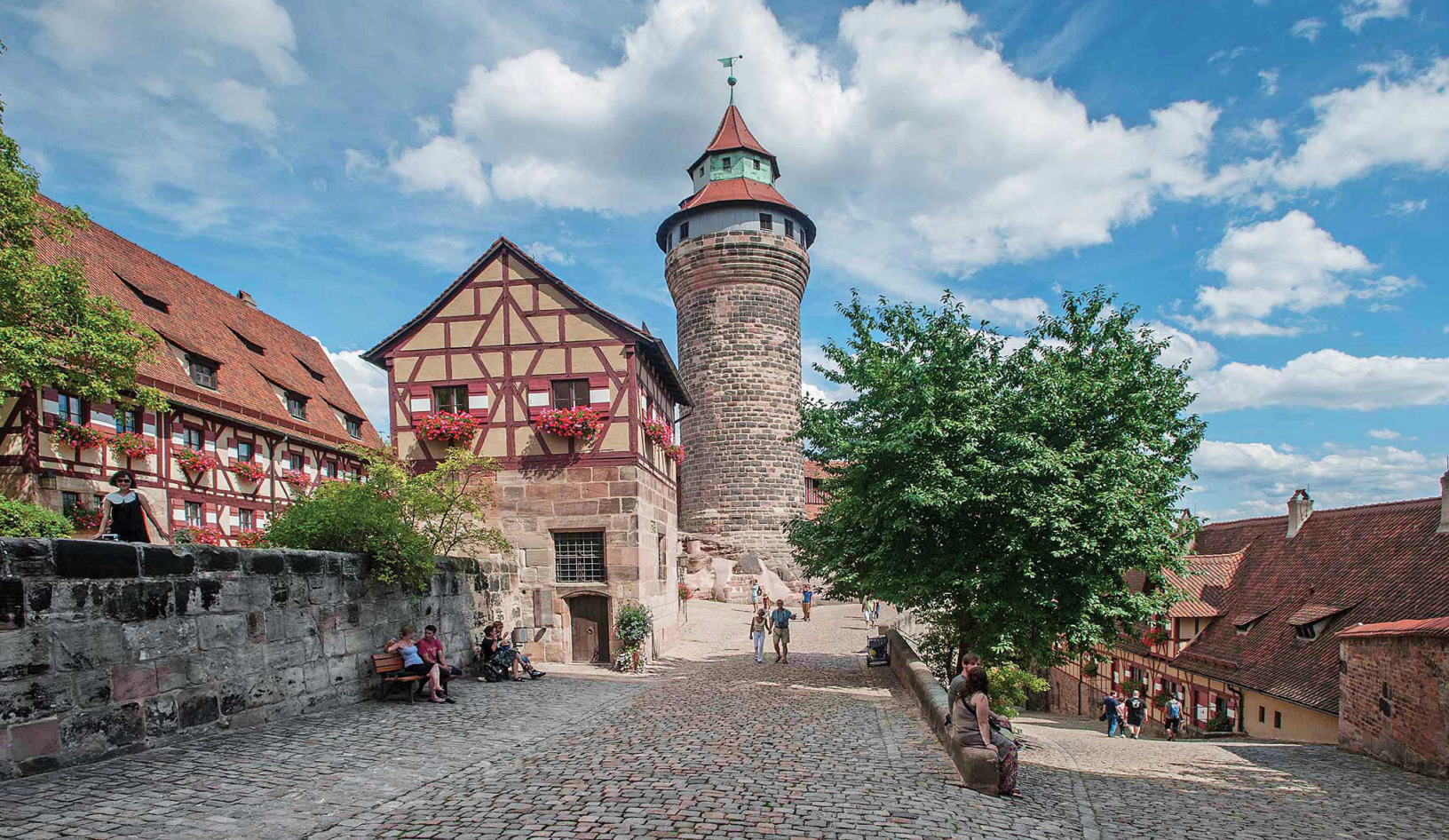
Optional Nuremberg excursion, Sinwell Tower

• Insurance coverage is Deluxe Group Plan from Travel Guard is included and for coverage details see webpage steviejaytravel.com/insurance covering cancellation charges; other terms at steviejaytravel.com/terms which are