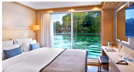
Stateroom with French "Balcony": Cat. C-D