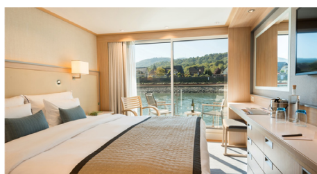
Stateroom with Veranda: Categories A-B