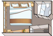
French Balcony C & D, 135 sq ft