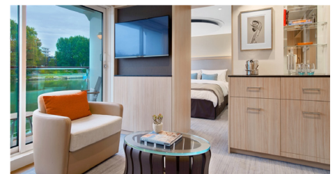
Veranda Suite: with Veranda and French Balcony Category AA