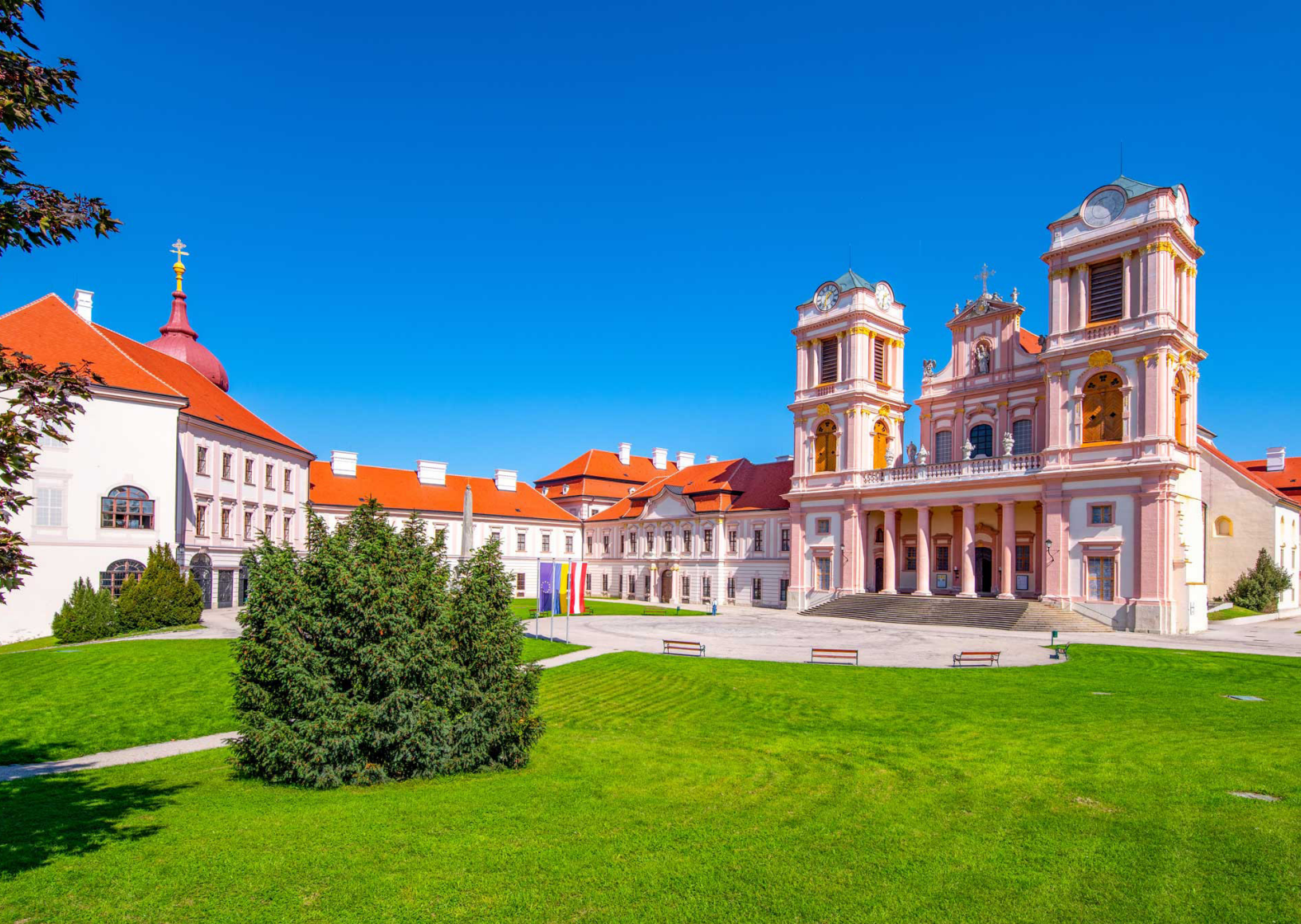
Göttweig Abbey, Krems, Austria

Director can help you plan your free time. Or, you may choose to join us for an optional excursion.