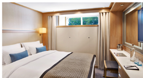
Stateroom with window: Categories E-F

But what if you or a family member becomes ill or has an accident? That's why we include AIG/Travel Guard Travel Insurance when you book. It even waives the pre-existing conditions exclusion. As long as you are medically able to travel when you book, you are covered. Note that Medicare does not cover you overseas! But our plan does! See plan details for more information and other coverage features.