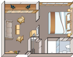
Veranda Suite AA, 275 sq ft