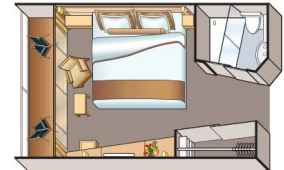
Veranda A & B, 205 sq ft