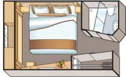
Standard with window E & F, 150 sq ft

Refer to product number 209441 P1 06/19 for Illinois (see online for other states' product codes).