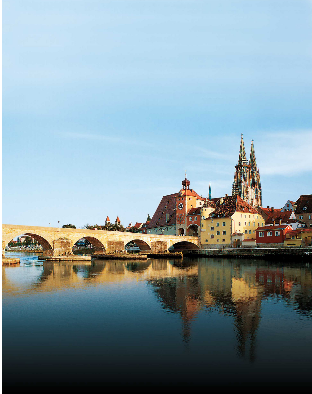
Above: Old Stone Bridge, Regensburg, Germany; below: Danube Narrows, Kellheim, Germany