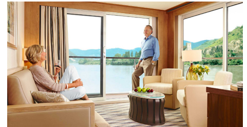
Explorer Suite with wraparound veranda and French Balcony: Category ES