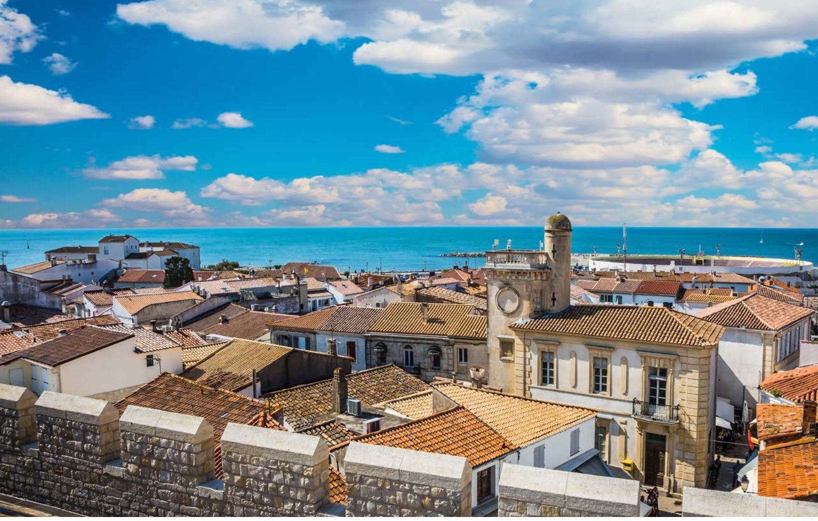
Saints-Maries-de-la-Mer on the Mediterranean