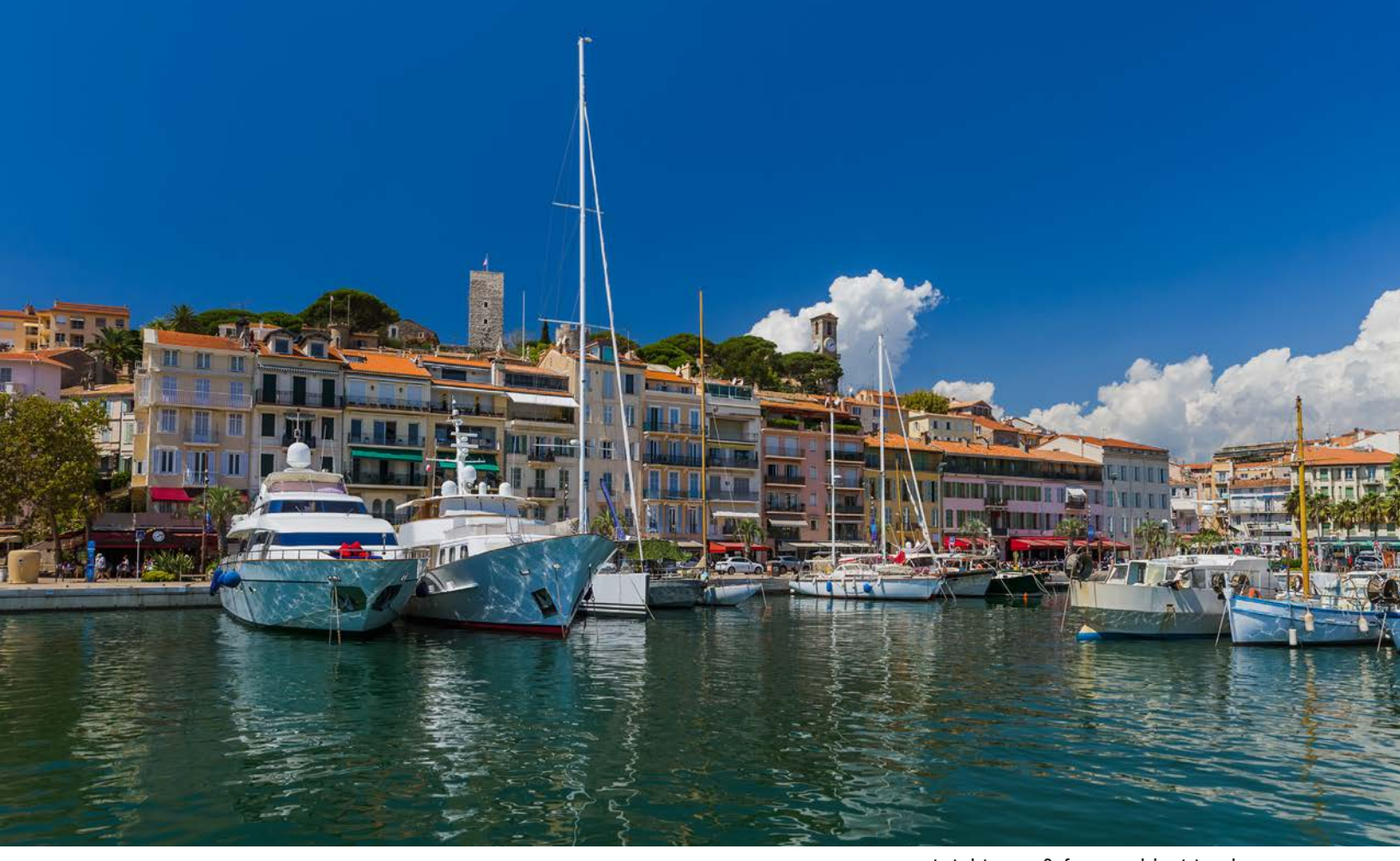
Cannes, location of the international film festival

Ratatouille - traditional French Provencal vegetable dish cooked in an oven