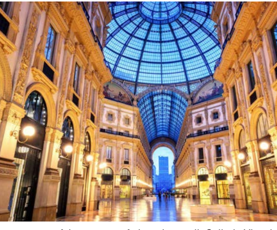
A better sort of shopping mall, Galleria Vittorio Emanuele II