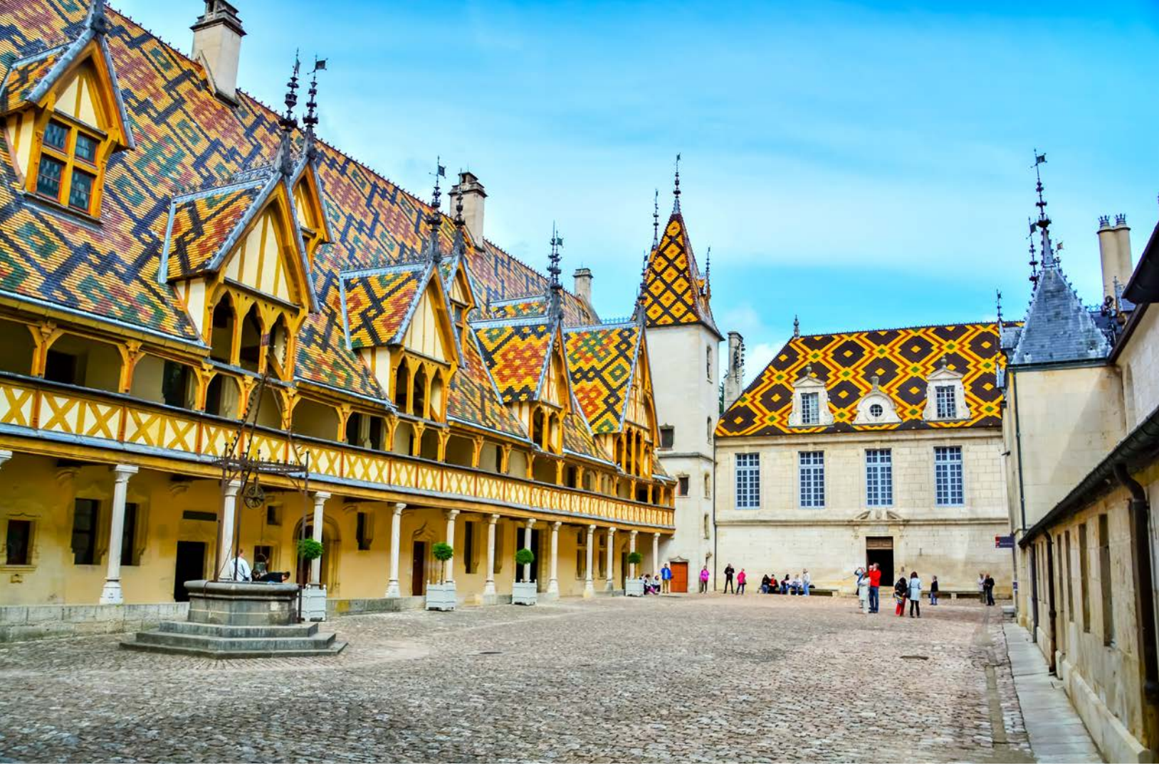
Hospices de Beaune, a hospital for the poor