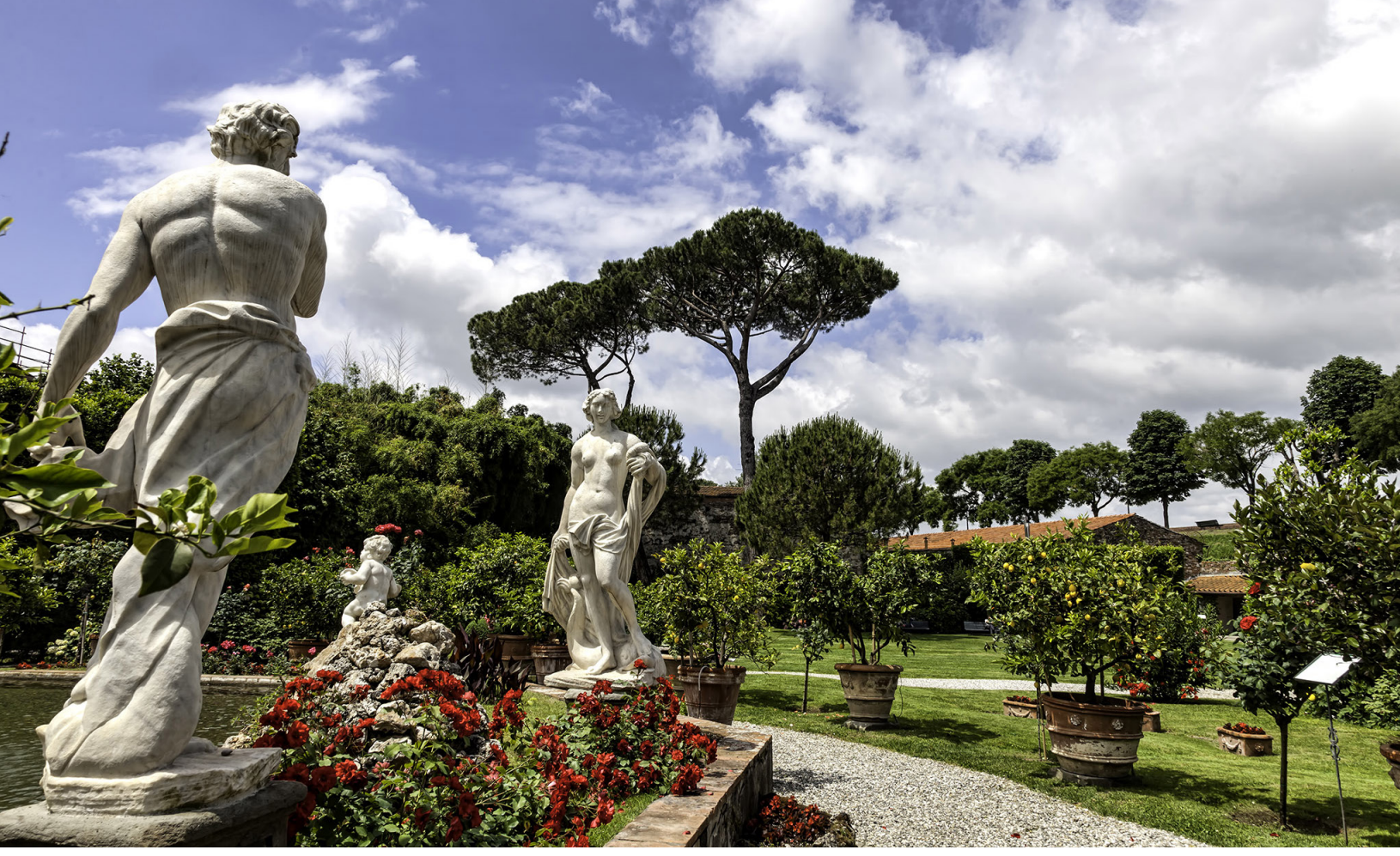
Palazzo Pfanner gardens in Lucca