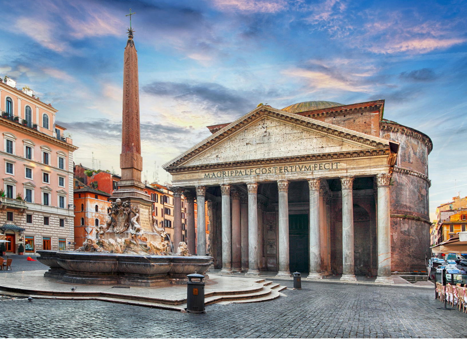
Rome, at top: The Pantheon; at right: a sidewalk cafe for a bit of la dolce vita; below: the Coloseum and the Roman Forum