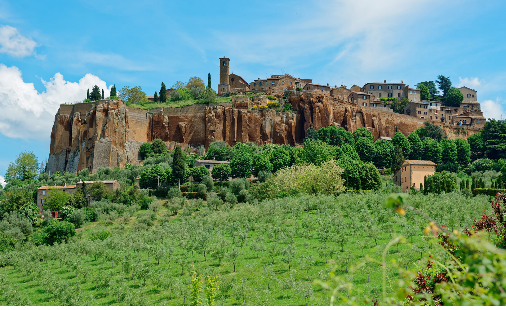
Visit clifftop Orvieto on the way to Rome